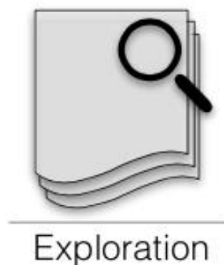
Figure 3: iExploreCorpora layered model.

Finally, iExploreCorpora intends to offer a set of concordance features, such as search for words in context, automatic extraction of the most frequent words and multi-words, amongst other features.